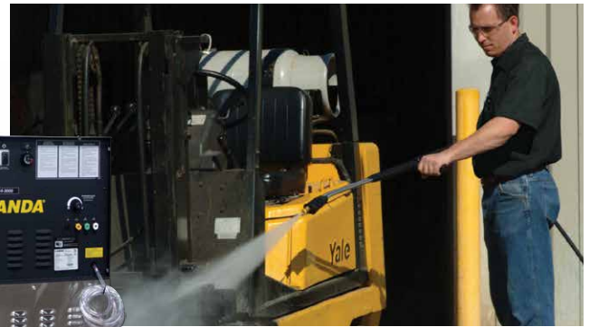
VHG4-30024 Shown with optional Stainless Steel Coil Wrap and 4-Panel Skirt & Cover