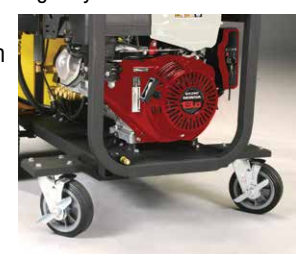
Shown with optional caster wheel kit

A technologically advanced engine-and-regulator combination eliminates the need for a battery or electrical connection, making it a convenient and versatile on-site choice for keeping your restaurant, resort, spa, or hotel clean and inviting!