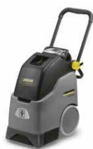
BRC 30/15 C