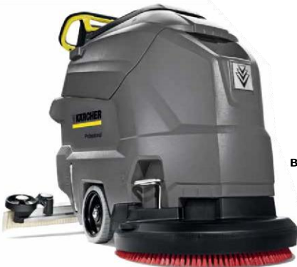
BD 50/50 C CLASSIC BP