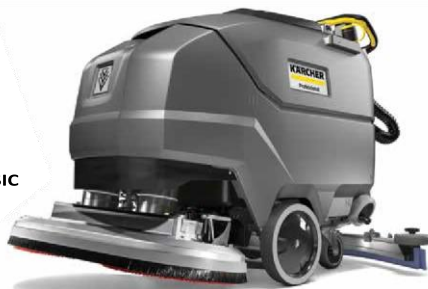
BD 70/75 W BP CLASSIC