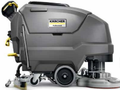
BD 80/100 W BP CLASSIC

Designed to meet all of your scrubbing needs without breaking the bank. With the BD 70/75 W Classic Bp, BD 80/100 W Classic Bp and BD 50/50 C Classic Bp scrubbers, Kärcher presents its Classic Scrubber line. These machines are battery-operated, have a very solid construction, and are characterized by their simple operations. They offer an economical start in floor cleaning and are suitable for use in industrial facilities, retail stores, municipalities, education and in cleaning commercial buildings. No matter the area size you're cleaning, there's a classic solution to fit.