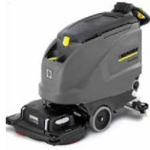
B 60 W BP