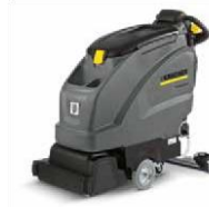
B 40 WITH R 55 HEAD