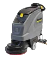
B 40 W WITH ORB