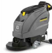
B 40 W WITH D 51 HEAD