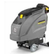
B 40 C NO DECK