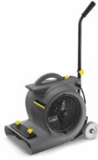
AB 84 CUL