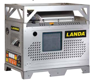
PDHW5-35624E/SS shown with optional stainless steel Lift/Stack Platform Kit and Emergency Air Shutoff Kit

uninterrupted cleaning. A sturdy steel frame is available in a polyester powder coat finish for added weather protection, or all-stainless steel for the ultimate insurance in high corrosion environments, making this unit the ideal choice for an offshore oil drilling operation. Highly versatile and built with the same attention to quality you've come to expect from Landa, the PDHW is a great all-around "mid-size" choice for all your cleaning needs!